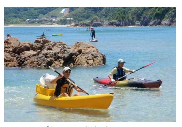
Clean-up activities by canoe (Uradome Kaigan Coast)