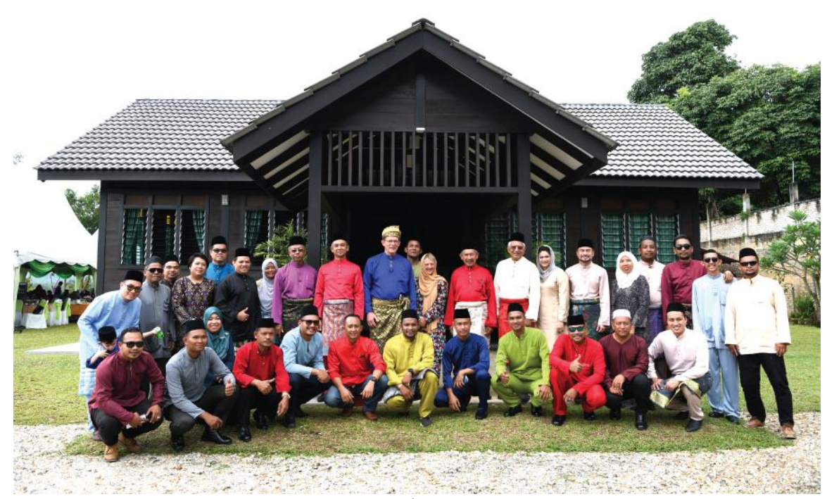
Figure 1 : Langkawi UNESCO Global Geopark 3<sup>rd</sup> Revalidation Closing Ceremony, 14 August, 2019