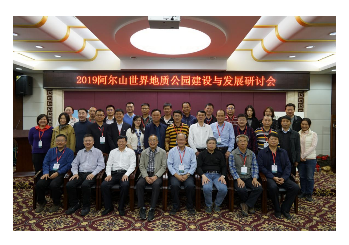
Arxan UNESCO Global Geopark Construction and Development Seminar