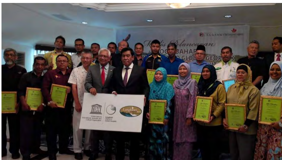
Figure 1 : Langkawi UGG Geopark Ambassadors Appointment February 2016

Representative Photo (from the most important event this year)