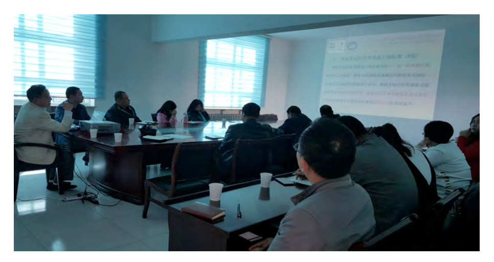
Take a training course among the local related staffs in Alxa Desert Global Geopark after participating in Beijin Global Geopark Management Training Course