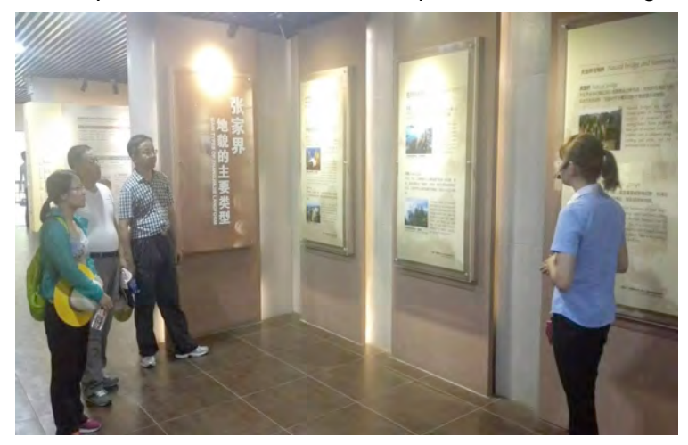
Visiting sisterpark Zhangjiajie Geopark and study the experience each other.