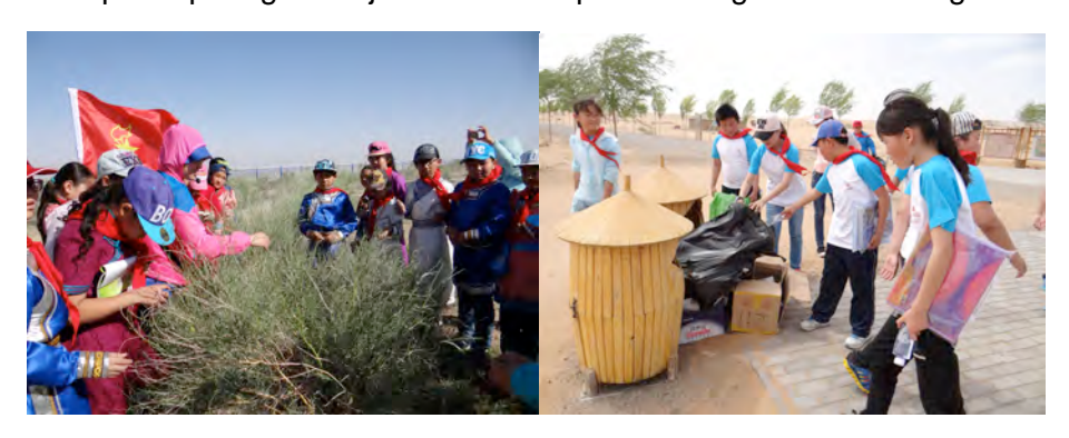
Hold a summer camp with primary school to get geoknowledge about desert forming, desert plants and the environment protection at the edge of desert.