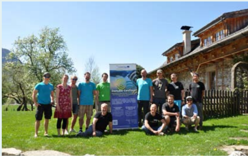
♦ GeoRafting workshop at Rafting Camp Palfau, April 2018

UNESCO Global Geopark Styrian Eisenwurzen, Austria