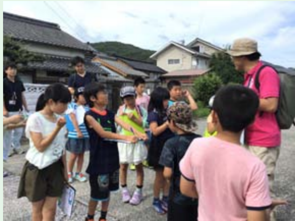
Walking the evacuation route