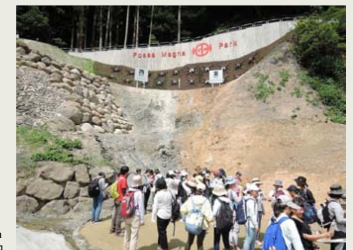
Fossa Magna Park Opening