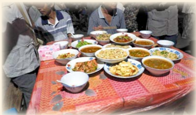
✦ Hetangjiu Feast