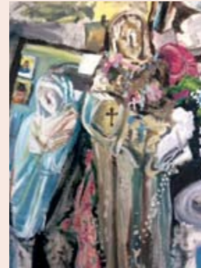
♦ Fig 4. Painting of religious cultural site by artist Mary Fahy

The initiative was funded under the EU Interreg Atlantic Area programme which supports the development of a European Atlantic Geotourism Route through collaboration