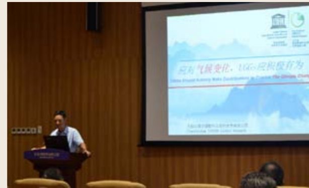
Oral presentation on climate change giving by Tianzhushan Geopark on the 5 th Asia Pacific Geoparks Network Symposium