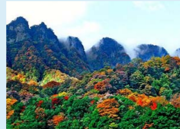
♦ Guangwushan-Nuoshuihe, China

The Percé Geopark in Canada is at the heart of the large Appalachian Mountain chain along eastern North America. The mountain formation and the magmatic and tectonic events of the area link to the opening of the Atlantic Ocean during the Jurassic and the Cretaceous periods (ca. 150 Million years ago). Over the last twenty thousand years—the last Ice Age—the Quebec segment of this chain has been submitted to the erosive action of glacial elements that gave the landscape its current shape. The territory is home to many ecosystems that feature diverse fauna and flora. Percé's main economic activities center on tourism, fishing and forestry.