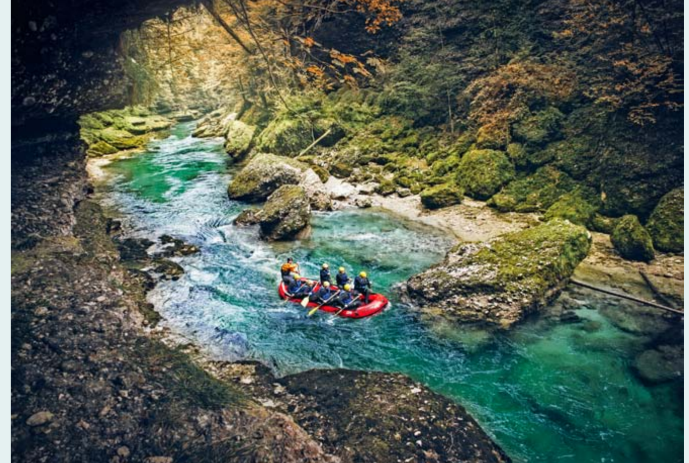
♦ GeoRafting in the conglomerate gorge of Palfau

The development of GeoRafting has started this year in April. The Geopark is working closely together with one rafting company at the moment. A workshop for GeoRaft guides took place already and is going to be repeated every spring to refresh their knowledge about the region and geology. Special training material is provided from the Geopark as well. An image flyer has been elaborated. In May 2018 a shooting took place for a GeoRafting image video in cooperation with the