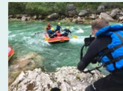
♦ Shooting for the GeoRafting image video, May 2018

UGGp Styrian Eisenwurzen, Austria o.gulas@eisenwurzen.com