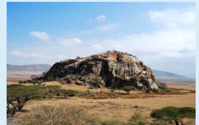
✦ Ngorongoro Lengai, Tanzania

One of the most important features of the Ngorongoro Lengai Geopark is the Ngorongoro Crater, home to great wildlife diversity, such as elephants, black rhinos, lion, gazelles, and other large mammals that co-exist with humans. The Oldoinyo Lengai 'Mountain of God' or 'Holy Mountain' in the Maasai language is the youngest and most active stratovolcano (2,962 m) of the Ngorongoro Volcanic Highland located at its northern end. This