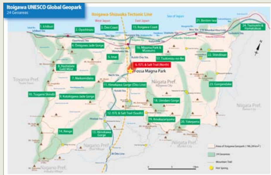
Location of Fossa Magna Park in the Itoigawa UNESCO Global Geopark

On August 2nd, after nearly a year of construction and over three years of careful planning and surveys, renovation work has finally completed at Fossa Magna Park in the Itoigawa UNESCO Global Geopark.