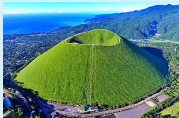
✦ Izu Peninsula, Japan

Izu Peninsula Geopark is located in the southeast of Honshu Island. It is a unique meeting place of two active volcanic arcs and various and ongoing phenomena linked to tectonic plate collision. The area's uninterrupted volcanic history over the past 20 million years is unmatched anywhere. Geothermal activity has also endowed this area with some of Japan's most famous hot springs. Izu has witnessed many natural disasters, such as volcanic eruptions, earthquakes and tsunamis, which have contributed to local beliefs as communities began to worship deities that were supposed to rule over natural forces and built over 90 shrines scattered across the Geopark.