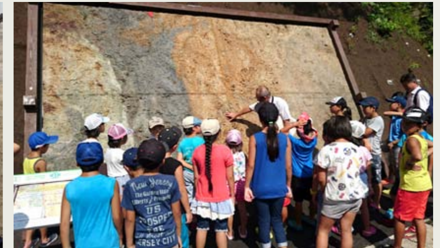
Visiting the Fault Exposure (L) and Wheelchair Accessible Exhibit (R)

the name "GeoPark." This is significant as it may have been the first use of the word "Geopark" in the world, although it had a very different meaning to the way it is used now.