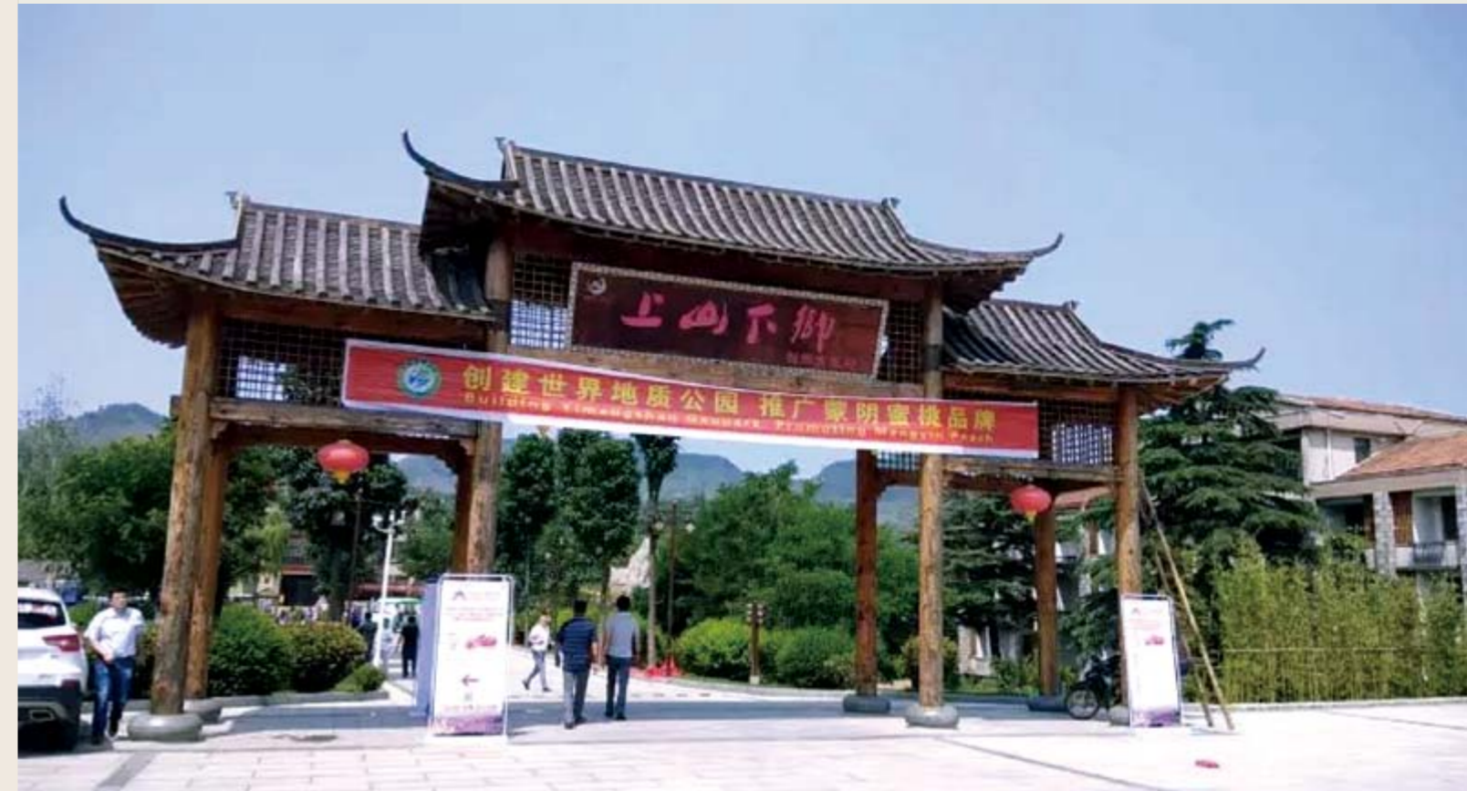
Tianzhushan UNESCO Global Geopark, China

To sum up, through appropriate daily management and protection, forestry project, clean energy utilization and science popularization, Tianzhushan UNESCO Global Geopark has eliminated the occurrence of major fire accidents in the geopark, improved the productivity of the forest stand, and protected the forest resources in the geopark. At the same time, the utilization of clean energy has also reduced carbon emission and fought against climate change effectively.