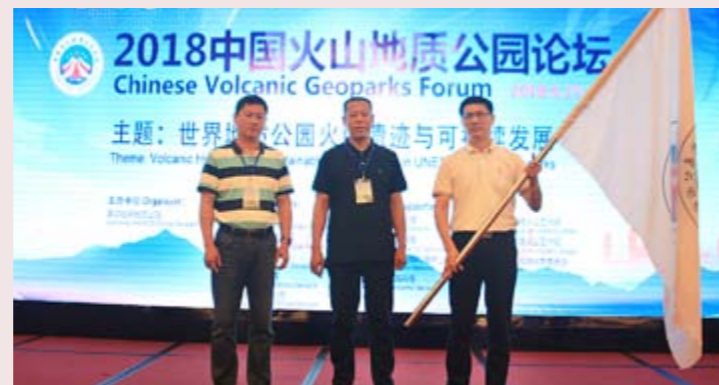
◆ Flag handover ceremony

2018 Chinese Volcanic Geoparks Forum aims at providing opening, innovative and shared platform to exchange knowledge and