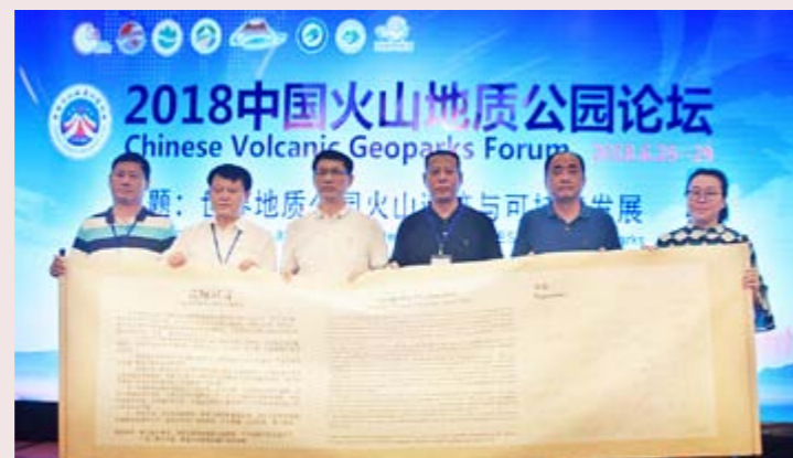
◆ Leiqiong Declaration