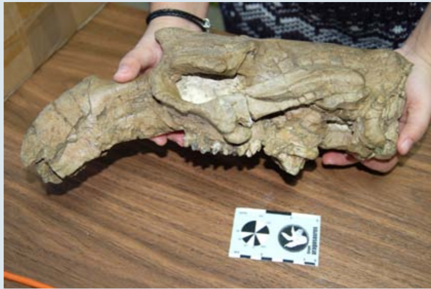
✦ Sirenian skull Sobrarbesiren Cardieli