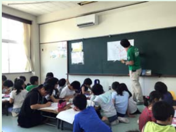
Discussing the route they actually walked at the end of the class

children interpret the hazard map. If it says a place is safe from the tsunami, children will believe that information. This taught us that children, unlike adults, may not question the information on the safety maps. We must consider