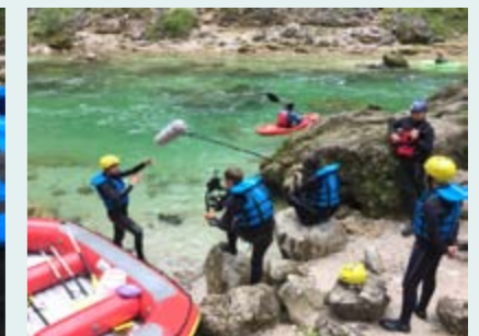
♦ Interview for the GeoRafting image video, May 2018