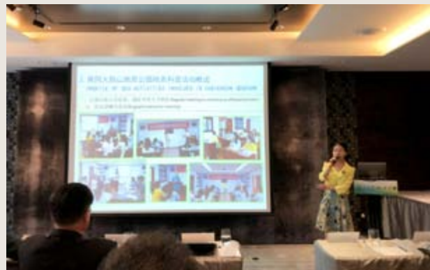
◆ Delegate from Huanggang Dabieshan UGGp

From 8 th to 13 th April, the Fourth Capacity Building Workshop for Geosciences Popularization themed on How to combine Science with Tourism Experiences was held in Hongkong UNESCO Global Geopark. In order to exchange experience and to learn from each other, more