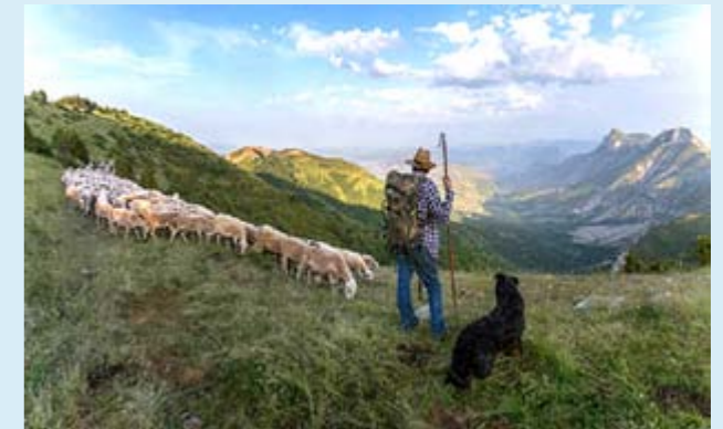
✦ Conca de Tremp Montsec, Spain

Conca de Tremp Montsec Geopark in north-eastern Spain, close to the borders of France and Andorra, is characterized by a set of East-West oriented mountain ranges and basins. This alignment corresponds to the various overthrust nappes making up the southern slope of the Central Pyrenees. The geological record covers the past 550 million years. The rich natural heritage of the southern slopes of the Pyrenees is internationally recognized as a natural laboratory for sedimentology, tectonics, external geodynamics, palaeontology,