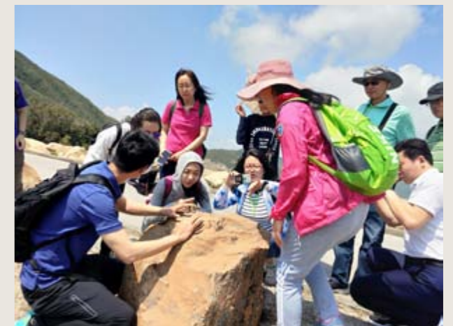
◆ Field mission in Hongkong UNESCO Global Geopark