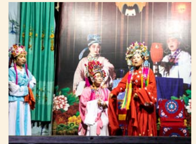
✦ Yushan Opera Troupe

The Yushan Opera Troupe was born in Huaiyu Township, Yushan County, which is at the foot of Sanqing Mountain, the sanctuary of Taoism. Huaiyu Township is also a major birthplace of Gan Opera (a major local opera in Jiangxi Province). Various opera troupes were formed due to numerous ritual activities performed by the locals, collectively referred to as "Yushan Operation Troupe".