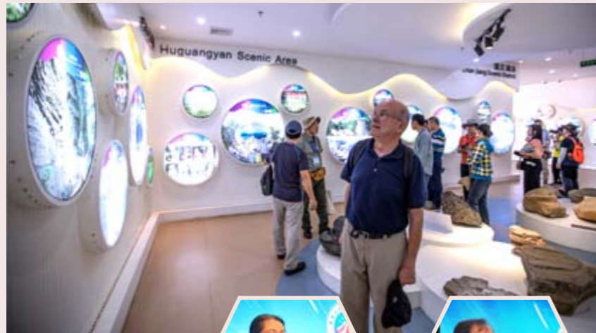
◆ Visiting Leizhou Museum