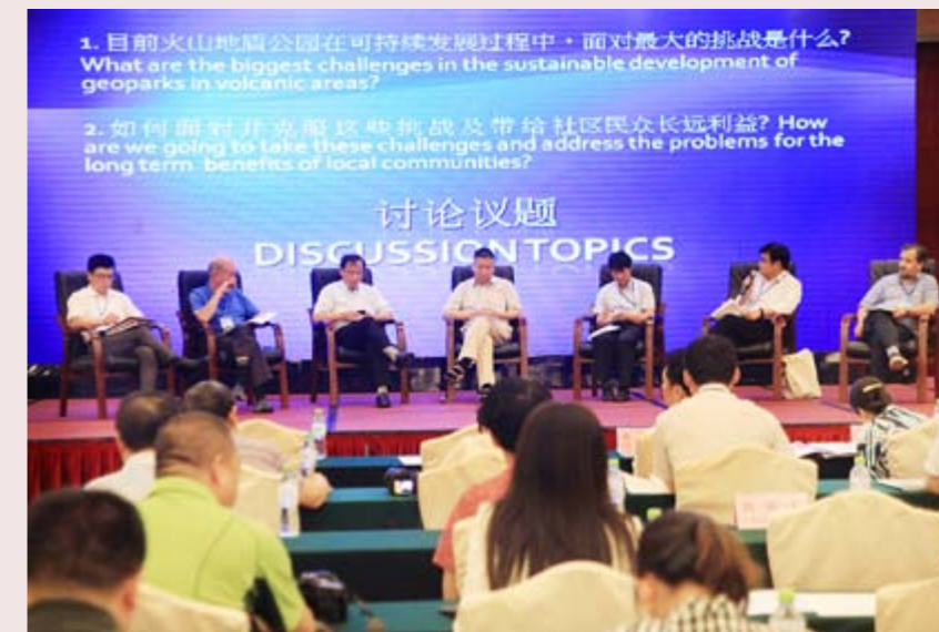
◆ Topic discussion

should promote geoheritage conservation, infrastructure and daily management for the Geopark.