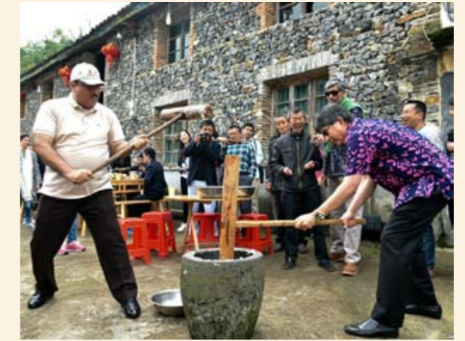
✦ Visitors Experiencing Threshing Ciba

to get close to its intangible culture heritages and fully presents the unique charm of its traditional culture and the cultural self-confidence of the people here. It is also hoped that these activities will join more young people in the work of cultural protection and enlighten people to live a better life with the joyfulness of traditional culture.