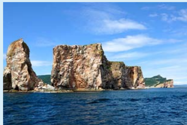
♦ Percé, Canada

Three components characterizing the Famenne-Ardenne Geopark are clearly visible in the landscape: Famenne, to the north, is a large depression with a schistose substratum. The Ardennes, to the South, form a vast plateau mainly composed of sandstone rocks. Between the two, the Calestienne presents a calcareous bedrock, rich in karst phenomena. The karst of this region is emblematic and its geological evolution, with disappearing and reappearing rivers, sinkholes and remarkable caves, has helped fashion the Geopark's omnipresent human activity. Limestone water is, moreover, essential in the brewing of the famous and typical 'Rochefort Trappist' beer.