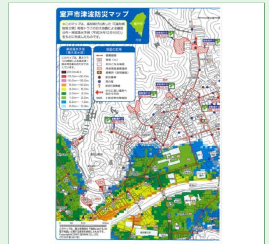
✦ Geohazard map showing the potential for tsunami-caused flooding

Our Geopark geographer is the main teacher of the class. During the first class, he taught students how to read a geohazard map (see photo1) that shows the potential for tsunami-