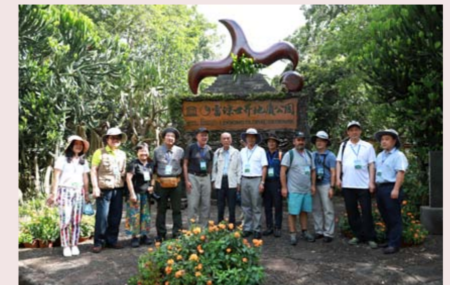
◆ Field trip-Mt. Ma'an Scenic Area