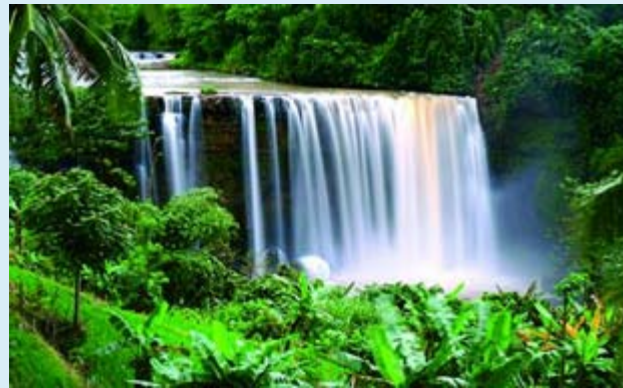
✦ Ciletuh-Palabuhanratu, Indonesia