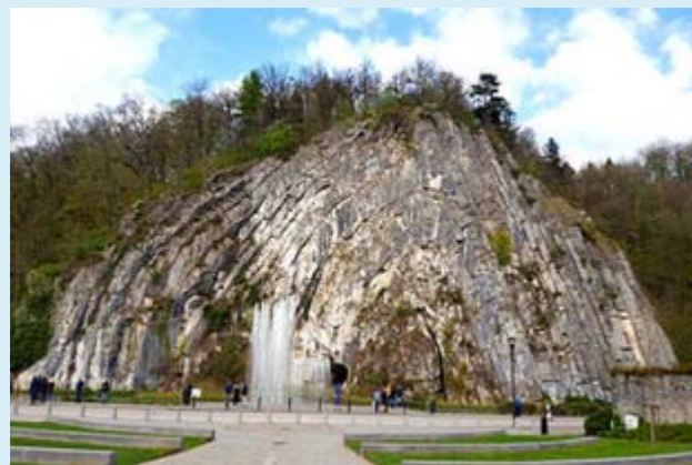
♦ Famenne-Ardenne, Belgium