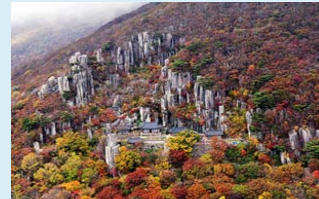
✦ Mudeungsan Area, Republic of Korea