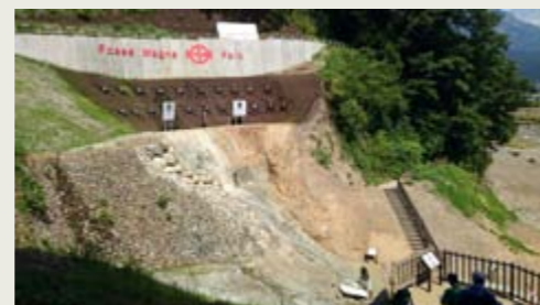
The Previous Fault Exposure (L) and the Newly Renovated Exposure (R)

to the east. In 1991, the Fossa Magna Park was also among the several "outdoor museums" throughout Itoigawa City given