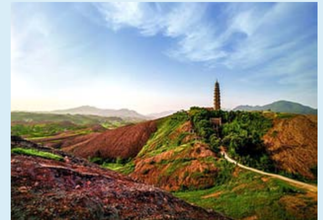
♦ Huanggang Dabieshan, China

Huanggang Dabieshan Geopark is located in Hubei Province, in eastern China. It demonstrates the geological evolution of the region, notably the collision between the tectonic plates of North China and the Yangtze. The oldest continental nucleus of the mountain belt, which resulted from this collision, is a combination of a garnet-biotite-gneiss and greenstone belt (Muzidian Group). These rocks were formed under high pressure and high temperatures