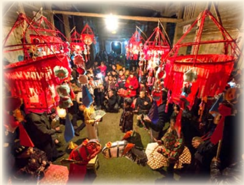
✦ Horse-lantern Drama

The Horse-lantern Drama is also known as "Bamboo-horse Drama" or "Running Bamboo Horse Dance." The lanterns are framed with bamboo and covered with paper or gauze. The fake horse's head is tied in front of the actor's waist, and the horse's butt is behind his waist. Lighted red candles are put in the empty horse heads and butts.