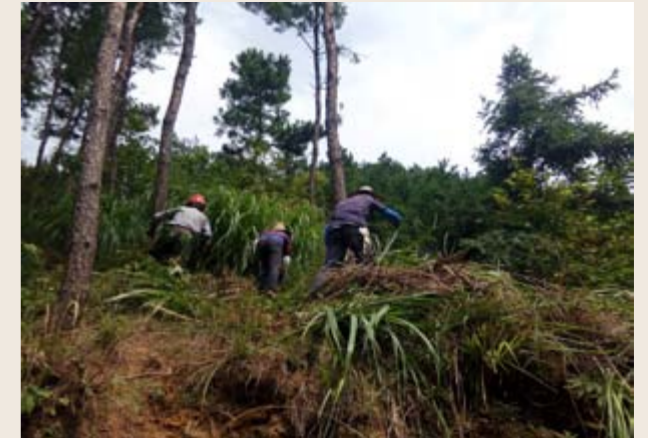
♦ Forest phase transformation

1.557 million yuan (244,000 U.S. dollars) was invested in the projects of forest phase transformation (including the replanting and transforming of the masson pine forest, the selective cutting of the masson pine, the forest phase transformation of 100 hectares of cedarwood, and afforestation of 33 hectares of Magnolia officinalis ) and construction of fire prevention forest belts (including the Schima superba and Camellia oleifera fire prevention forest belts). Through the