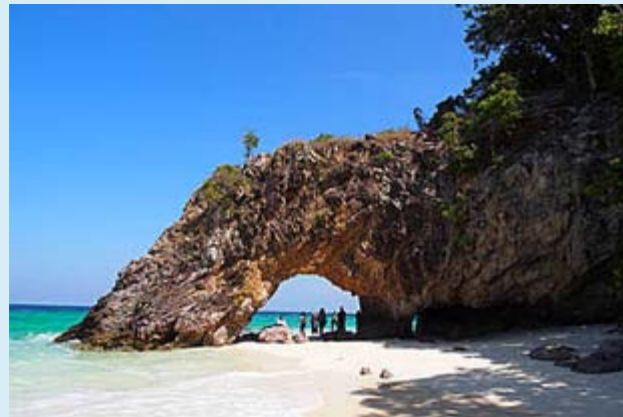
✦ Satun, Thailand

volcano produces natrocarbonatite lava that contains almost no silicon, which is unique. The Olduvai Gorge, the most important paleoanthropological site in the world, has volcanic beds formed in the Pliocene Epoch with an unsurpassed record of past environments, including hominid fossils, as well as Middle and Late Stone Age artefacts and a wide range of fossilized fauna.