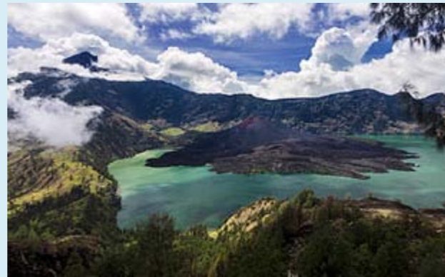
✦ Rinjani Lombok, Indonesia

The nearly circular-shaped Lombok Island with its 70-kilometre 'tail' of a peninsula, is one of the Sunda Kecil Islands, located between Bali and Sumbawa. The geology of Lombok Island is dominated by Quaternary calc-alkaline volcanoes covering the Neogene clastic sedimentary rocks, the Oligo-Miocene volcanics and the Palaeogene-aged intrusive igneous rocks. The formation of the volcanic complex is due to the subduction of the Indian Ocean tectonic plate under the edge of the South East Asia tectonic plate. The Sasak population of Lombok is multi-ethnic and multicultural. The diversity of the Sasaks' cultural heritage is reflected in buildings such as temples and old mosque.