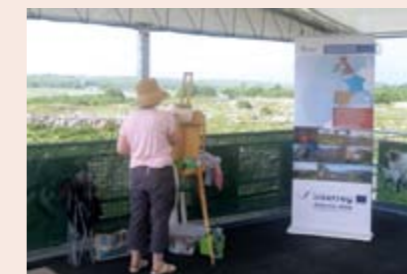
Fig 1. Artist Kaye Maahs at the Caherconnell Fort Visitor Center

intermediaries by painting on location at the visitor centers, rather than in their studios or in the more isolated parts of the Burren, away from the distractions of visitors. Two of the artists in location are shown here in Figs 1,2: