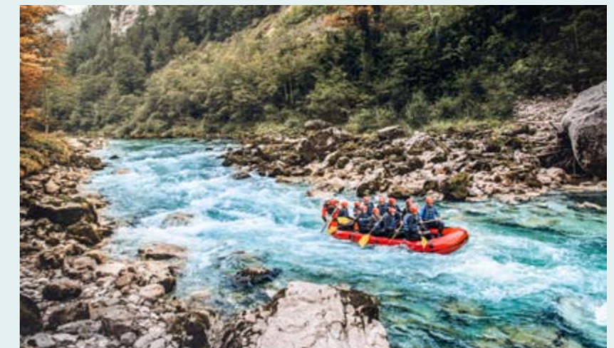
♦ GeoRafting along the Salza river