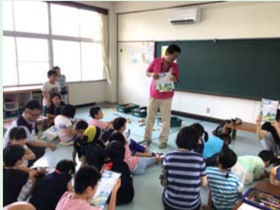
Children learning to read the map