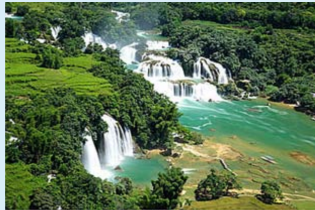
✦ Cao Bang, Viet Nam

The Cao Bang Geopark in a mountainous area in