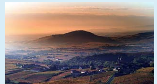
♦ Beaujolais, France

The Beaujolais Geopark is located in a region of France known around the world for its twelve protected vineyard appellations. But Beaujolais country also features other remarkable geological and culture treasures. The Beaujolais' complex geology, formed over 500 million years, underpins a diversity of landscapes, natural habitats and building stones used in local construction. The geological heritage and history of the Beaujolais has influenced the lives and culture of its inhabitants, in the past and continues to do so.