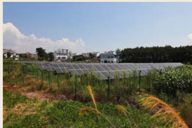
Photovoltaic power station

In order to effectively reduce carbon emission, actively respond to climate change, and improve air quality, recently, the geopark has promoted the construction of photovoltaic power stations, which produce are clear energy. At present, with a grid connected electric quantity of 6,000 kW, 51 photovoltaic power stations have been built in the geopark.