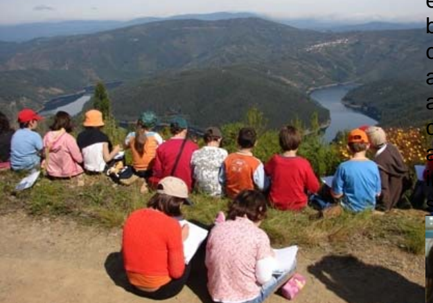
"Searching for the Waters", for elementary school (7-8 years old)

Cruziana: What school levels are Educational Programs destined for?