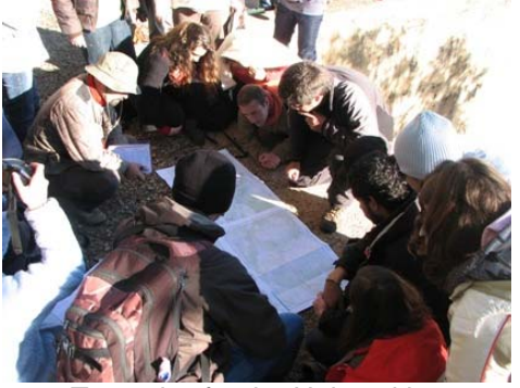
Tectonics for the Universities

raw materials and building. Consciousness and education of people is important to develop well-prepared and active citizens. By the other hand, geosciences contribute to understand the History of Earth and Life enabling people meet, love and protect our planet.