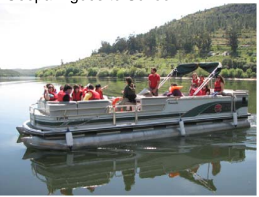
Portas do Ródão Natural Monument Boat Trip

"School meets the Geopark" and "Geopark goes to School".