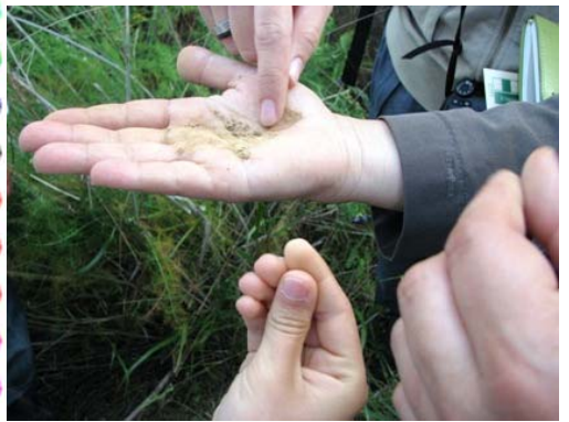
"Rock Detectives" for primary schools

Cruziana: In a territory located in a very unpopulated region, far from big urban centres what is the meaning of 2500 students and 300 teachers in the Naturtejo Geopark, in the last year?