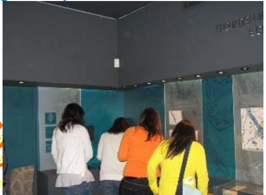
Vila Velha de Museum gives the introduction to the field trip

Cruziana: In your opinion how important is to educate the general public to Geosciences?