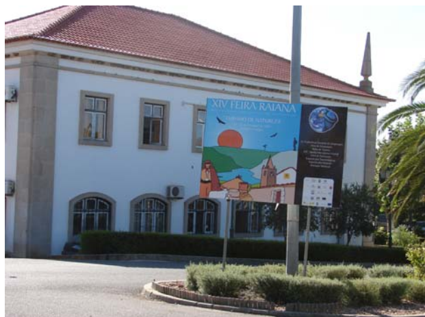
The EGN Conference is out there!