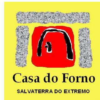
Casa do Forno logo

Casa do Forno: In the present we are betting in a family environment for our guests, to offer quality products and promote our geoproducts. In the future we plan to develop our tourist programs and make them better and better.