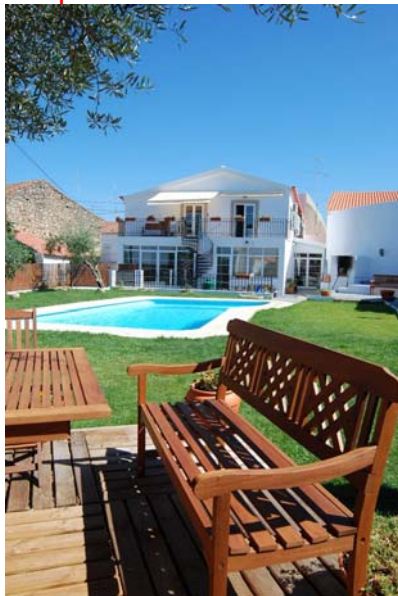
Casa do Forno Guest House

Cruziana: Besides GeoBakery, Casa do Forno is also a Guest House and Geotourism activities provider. Do you think the key of success is to bet in innovative products?